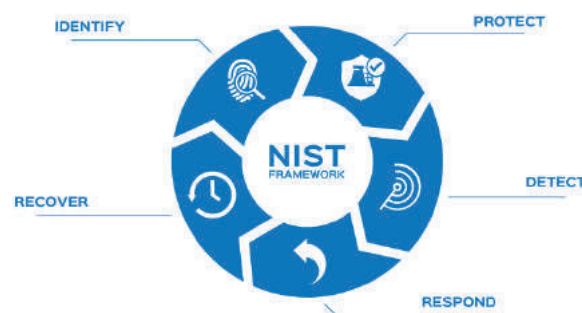
Figure 4: NIST Core Functions

The Framework Core provides a set of activities to achieve specific cybersecurity outcomes, and references examples of guidance to achieve those outcomes. The main Core Functions are Identify , Protect , Detect , Respond , and Recover .